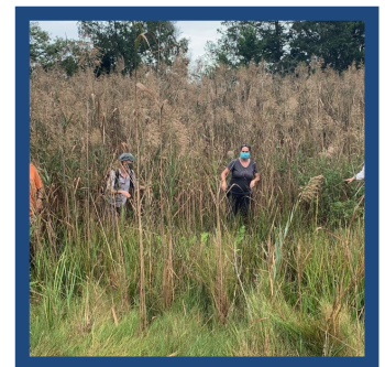
Researchers scouting a potential field site in Maryland.