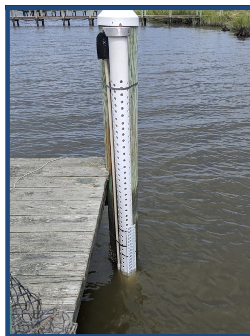
A monitoring station used to detect pollution in the Inland Bays.