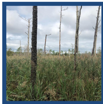
Ghost forests, or dead trees, resulting from saltwater intrusion